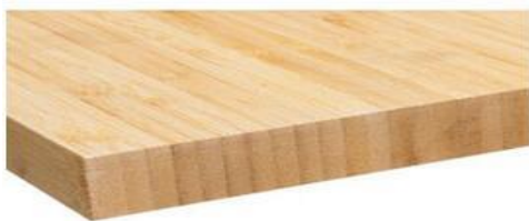
Single layer vertical