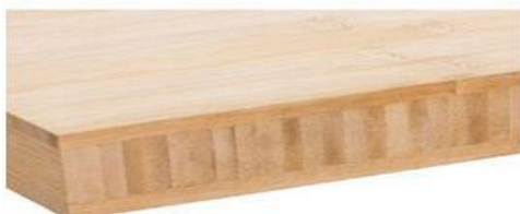
3 Layers, face horizontal, Middle vertical