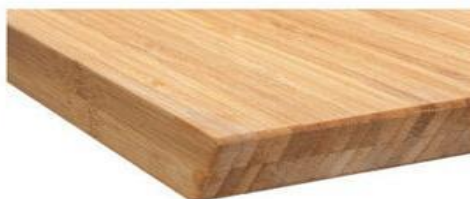
2 Layers vertical