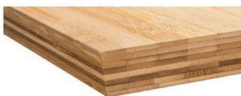
8 Layers, horizontal per layer