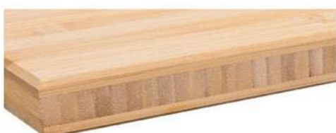
5 Layers, horizontal faces, Middle vertical