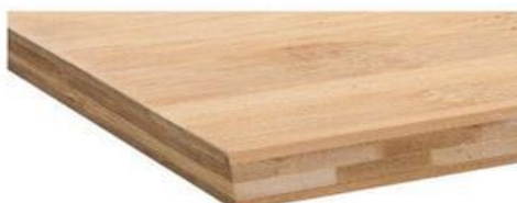
4 Layers, face horizontal, Middle across horizontal