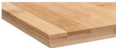
3 Layers, horizontal per layer