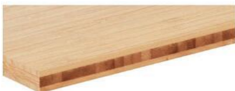
3 Layers, face vertical, Middle vertical